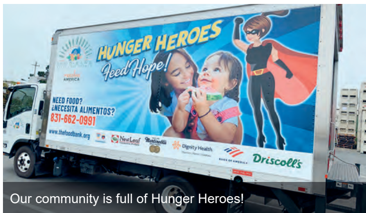
Our community is full of Hunger Heroes!

Check out more great organizations that have made the Community Cares list on our homepage www.thefoodbank.org