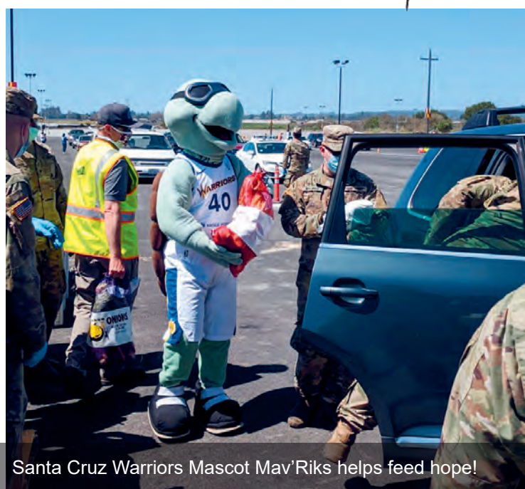
Santa Cruz Warriors Mascot Mav'Riks helps feed hope!