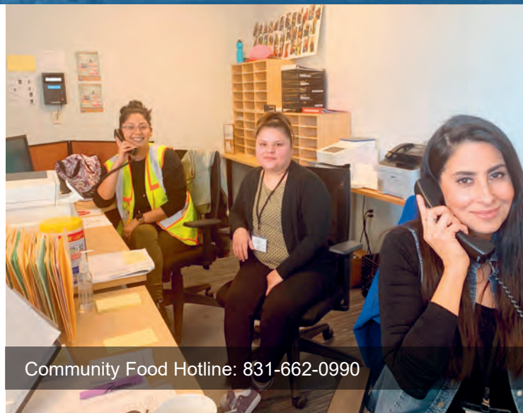
Community Food Hotline: 831-662-0990

These distributions can accommodate hundreds of vehicles. Since our first distribution on March 27th, we have been distributing an average of 96,000 pounds of food each Friday for an average of 2000 families at our drive through distributions.